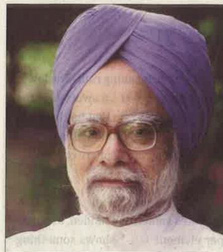
Prime Minister Dr. Manmohan Singh

Apart from flagship infrastructure projects we are pursuing together like the Dedicated Freight Corridor (DFC) and the Delhi-Mumbai Industrial Corridor (DMIC), trade and investment relations between India and Japan are intensifying. As we are starting from a modest threshold, the potential for growth is immense. India's economic dynamism and youthful vibrancy provide ample opportunities for mutually beneficial