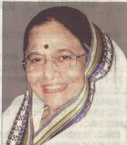
President Smt. Pratibha Devisingh Patil

India and Japan share historical and cultural ties and an Asian identity. Our relationship has been marked by mutual goodwill, amity and respect. This legacy has remained unbroken into the modern era, which has seen our bonds strengthen based on our shared values of freedom, democracy and the rule of law. Our shared economic and strategic interests, and common aspirations for Asian economic integration, make us natural partners in the 21st century, which belongs to Asia.